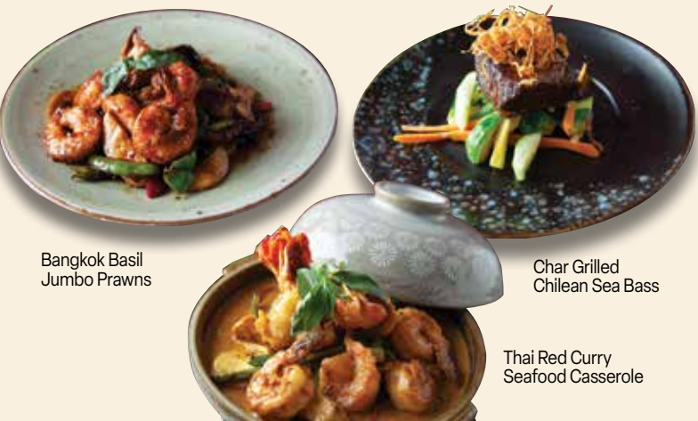
Bangkok Basil Jumbo Prawns