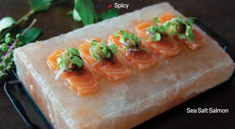
Sea Salt Salmon