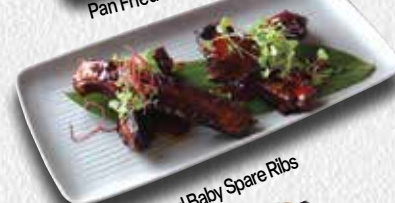
Grilled Baby Spare Ribs