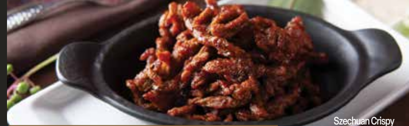
Szechuan Crispy Dry Beef