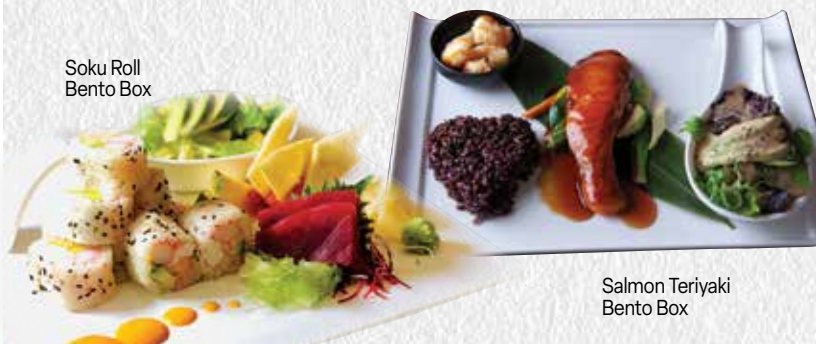
Salmon Teriyaki Bento Box