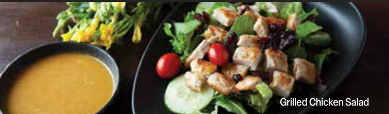
Grilled Chicken Salad