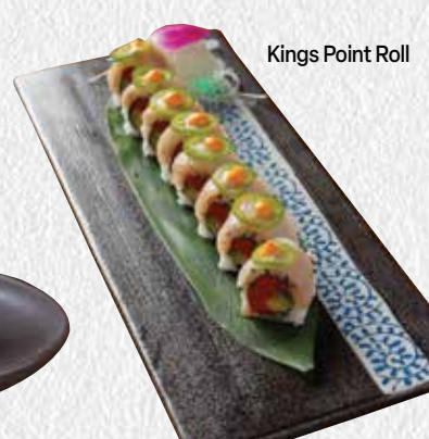
Kings Point Roll