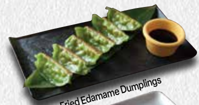
Pan Fried Edamame Dumplings